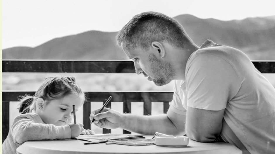
Parenting program under funding threat