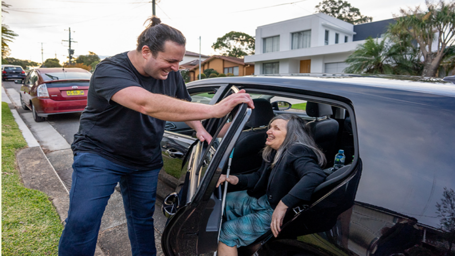
A free ride for people with disability